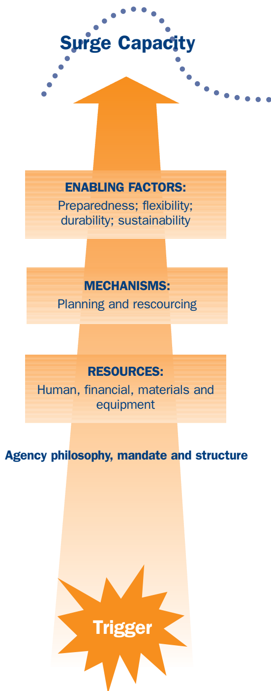
Figure 2 – Understanding surge capacity